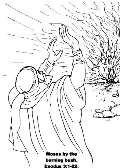
Moses by the burning bush. Exodus 3:1-22.